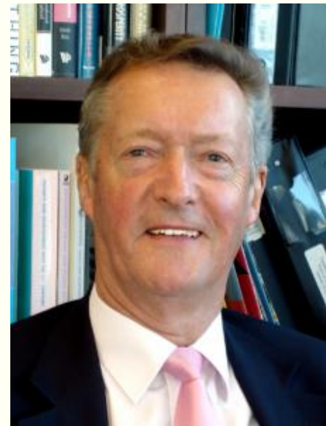
Sir John Daniel Education Master, DeTao Masters Academy