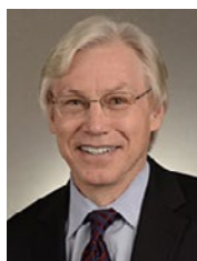
Above (from top): Bobby Scott (Democrat-Virginia), US