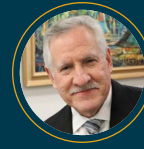
CARLOS SANTIAGO Commissioner Massachusetts Department of Higher Education